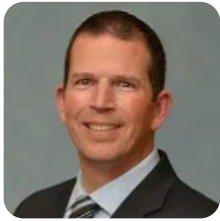
District 93 Rep. Brian Bergkamp (Republican)

brian.bergkamp@house.ks.gov 785-296-1177