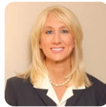
District 30 Sen. Renee Erickson (Republican)

oletha.faust-goudeau@senate.ks.gov 785-296-7387