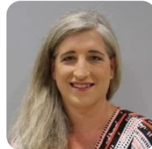
District 86 Rep. Abi Boatman (Democrat)