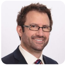
District 27 Sen. Joseph Claeys (Republican)

joseph.claeys@senate.ks.gov 785-296-7353