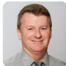
District 90 Rep. Steve Huebert (Republican)