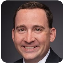
District 81 Rep. Blake Carpenter (Republican)

blake.carpenter@house.ks.gov 785-291-3500