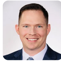
District 26 Sen. Chase Blasi (Republican)